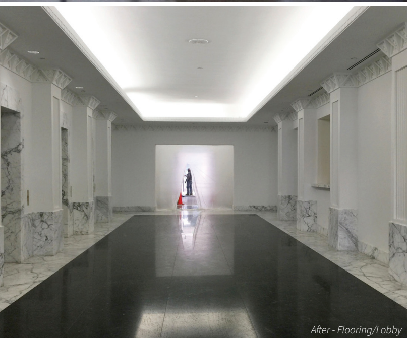
After - Flooring/Lobby