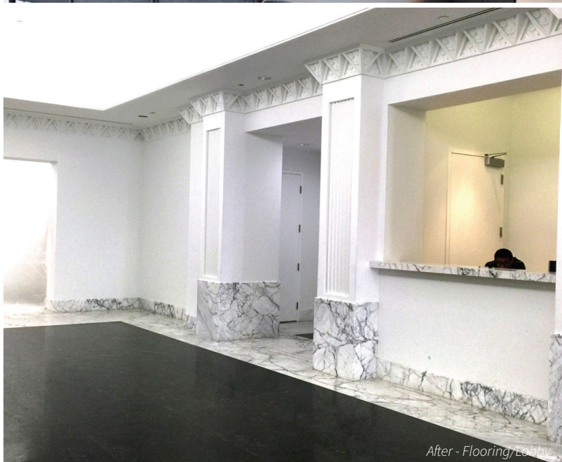
After - Flooring/Lobby