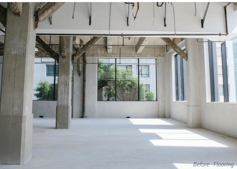
Before - Flooring