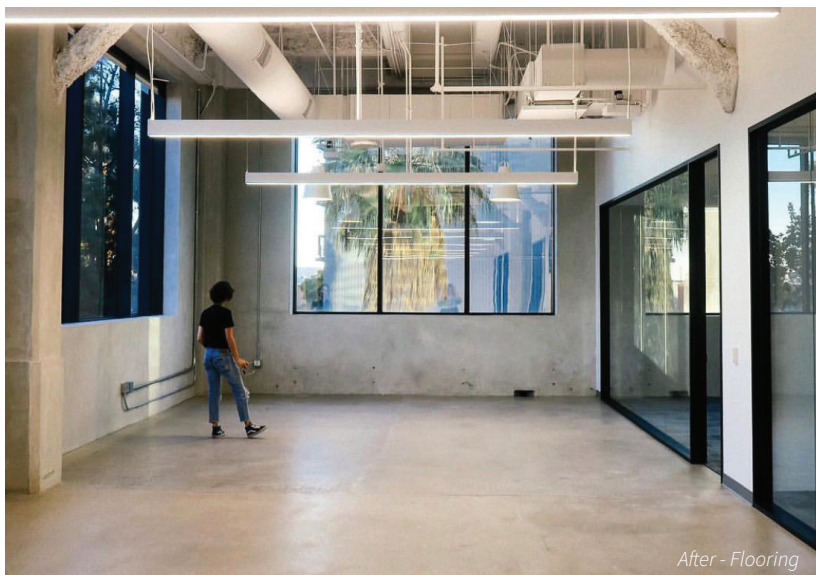
After - Flooring