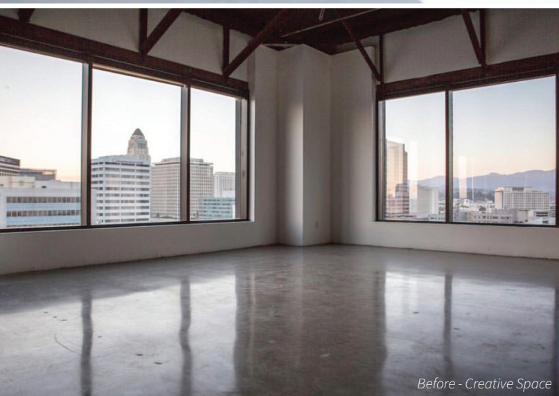
Before - Creative Space